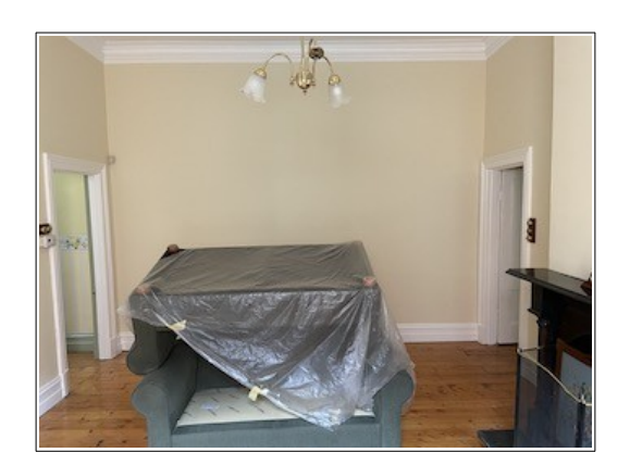
Photos here show the plastering (left), and the final paint job (right).

The cracks in the room's plaster were mainly of a thin surface type which were easily fixed. There were a couple were a bit of extra scrapping and filling was required but not to any great extent. He did a great job.